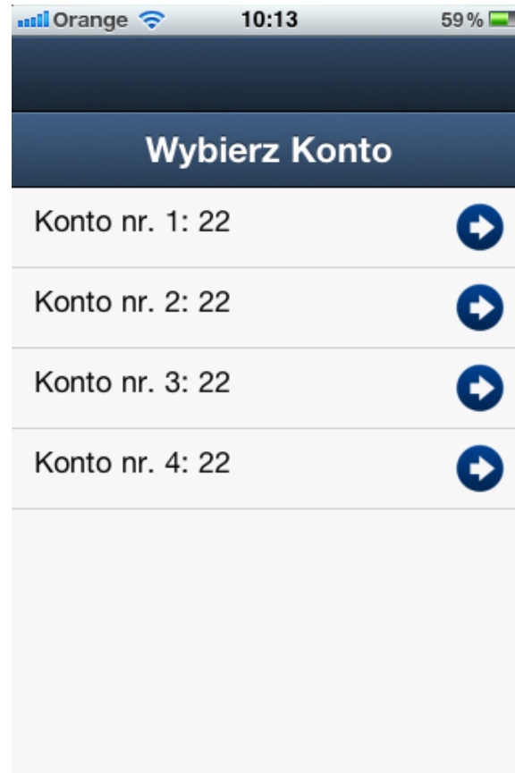
multiple SIP accounts